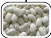
10 mm Sized Product - 7