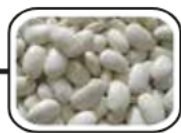
8 mm Sized Product - 5