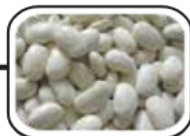
6.25 mm Sized Product - 2