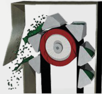
Continuous Cup Style