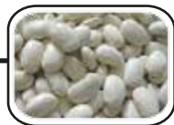
6.25 mm Sized Product - 2