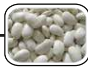
8 mm Sized Product - 5