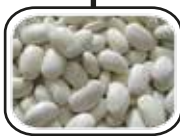
10 mm Sized Product - 7